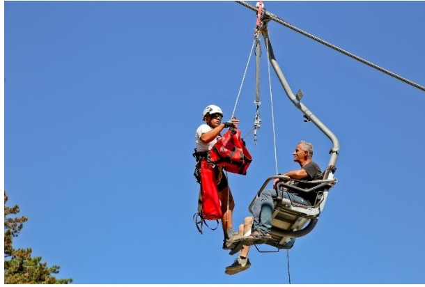
1. Picture: rescuing those in trouble

Based on picture 1, we can understand why the operator of the equipment can impose special conditions on the passengers. Unfortunately, it may happen at any time with any means of transport that such techniques have to be used.