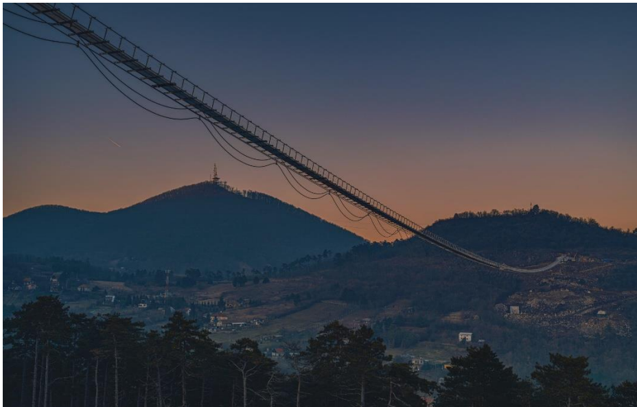
2. Picture: The bridge of national unity

Hungary's the currently longest ropeway and the only ropeway with cabins can be found in Sátoraljaújhely. The geometric arrangement of one of the ropeways is very rare. The task of the ropeways will be to serve Hungary's only suspension bridge that is currently in operation, which will be the one of the longest in the world at the moment.