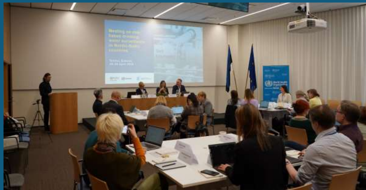
Workshop on WSP auditing Croatia, May 2024