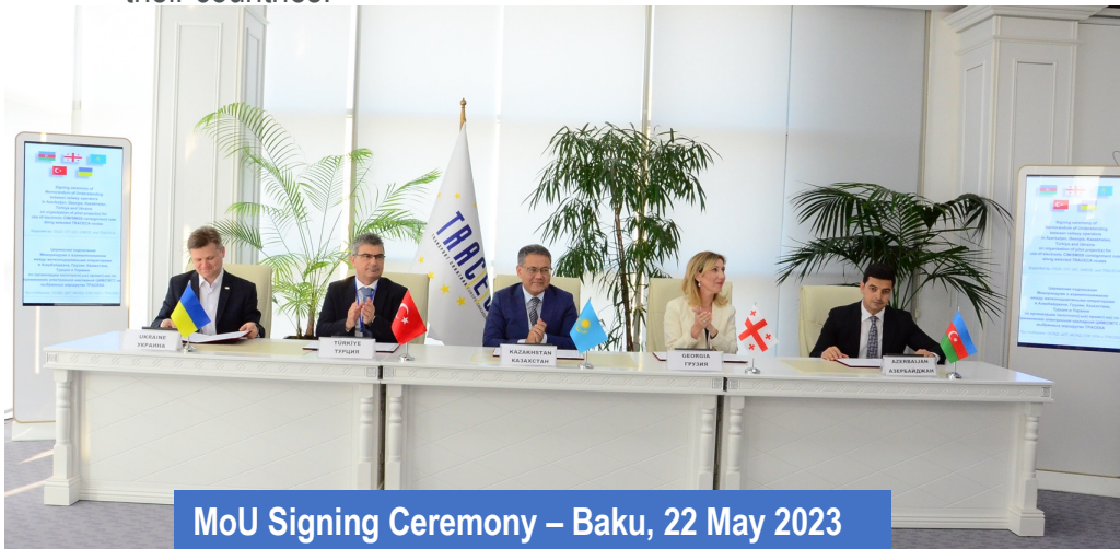
MoU Signing Ceremony – Baku, 22 May 2023