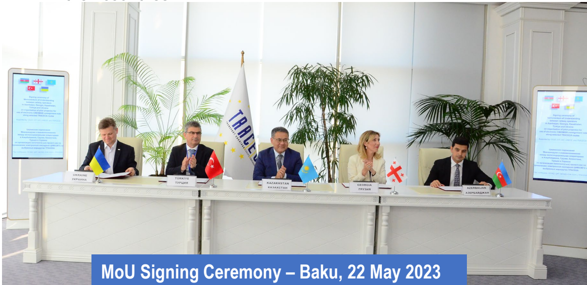
MoU Signing Ceremony – Baku, 22 May 2023