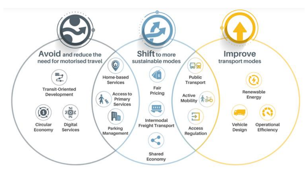
Figure I Avoid-Shift-Improve (ASI) measures