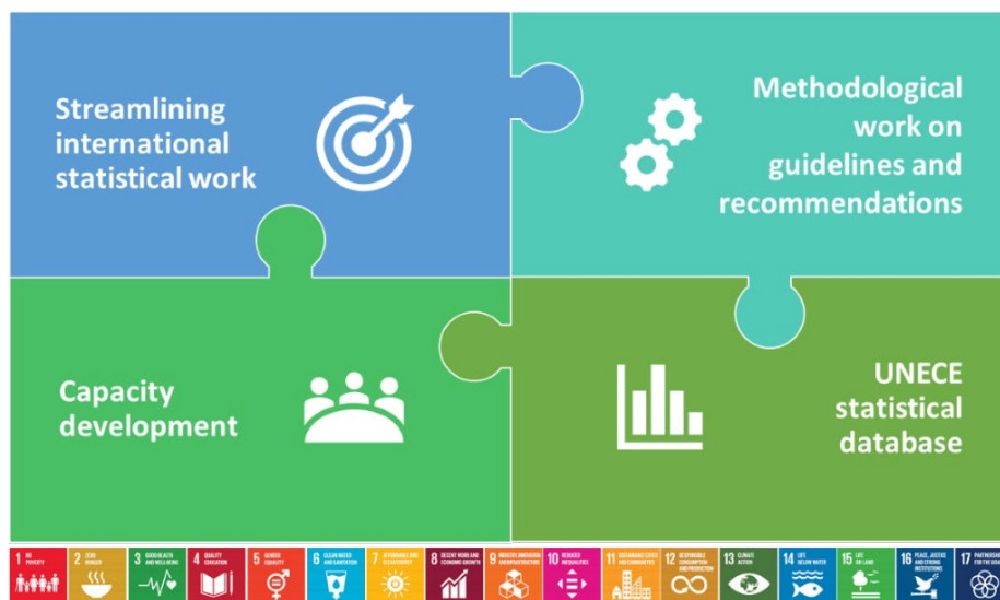
Work streams of the Statistical Division of UNECE