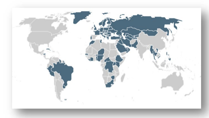
Convention on Road Traffic 1968

Convention on Road Signs and Signals 1968