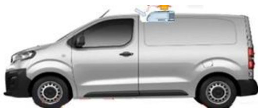
6. Case No. 2: Standard production vans with integrated insulation and unit partially recessed in the roof, with a roof air deflector: