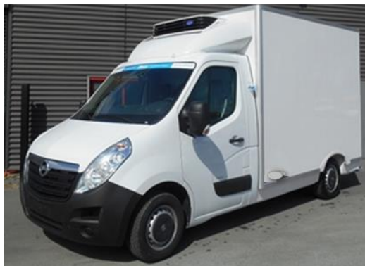
8. Case No. 4 : Standard production vans with integrated insulation and the unit installed under the chassis or in the engine compartment: