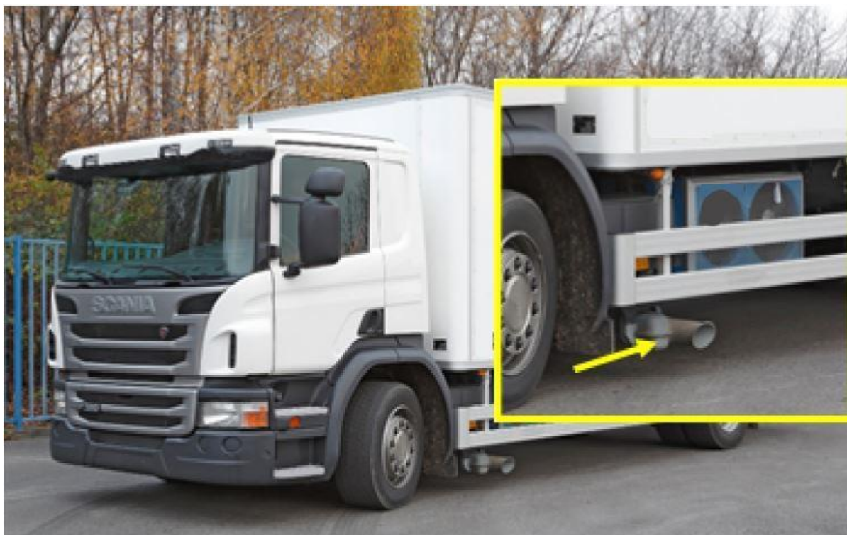
10. Case No. 6: Semi-trailers with deflectors: