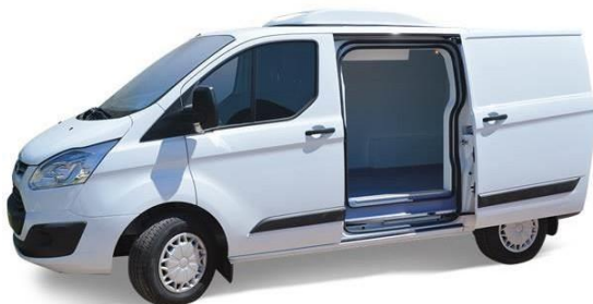
7. Case No. 3: Chassis cabs with front-mounted units and a deflector over the cab: