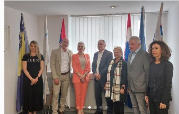
63 rd Session of the Sava Commission