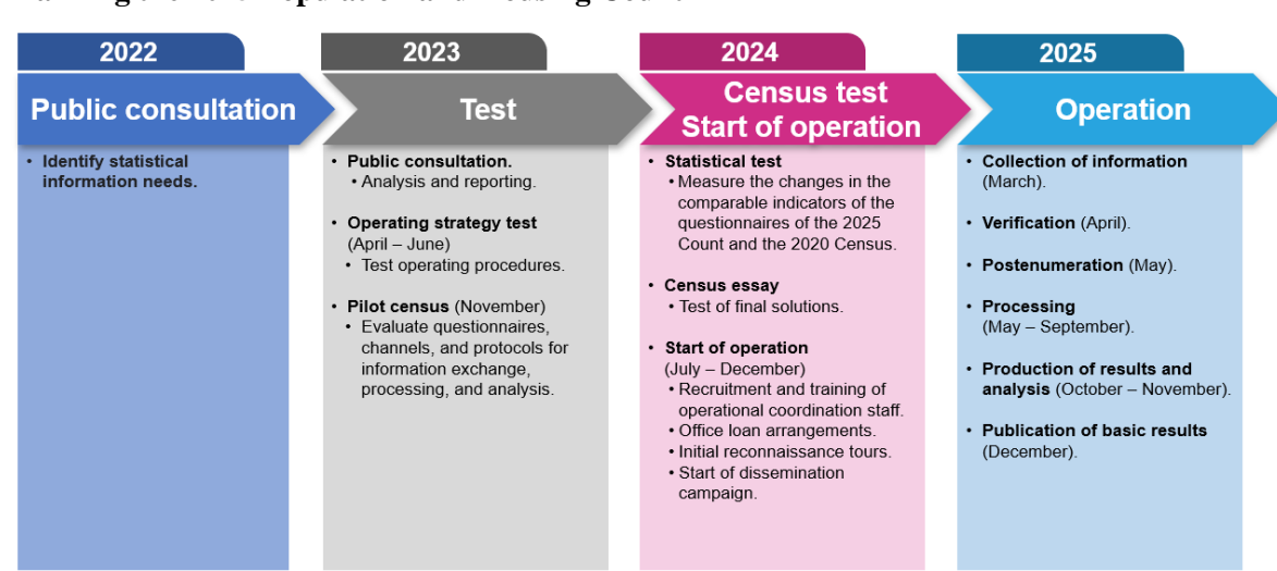
Figure 3 Planning the 2025 Population and Housing Count