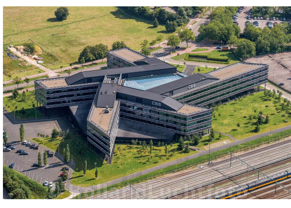
Sustainable heating and cooling using the water in mine tunnels

In 1974: the last Dutch coal mine was closed and was replaced by 2nd office of Statistics Netherlands