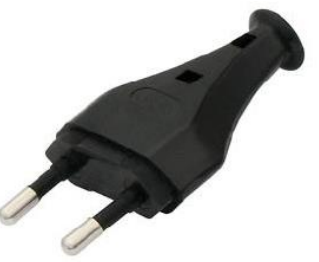
Type C: This will fit