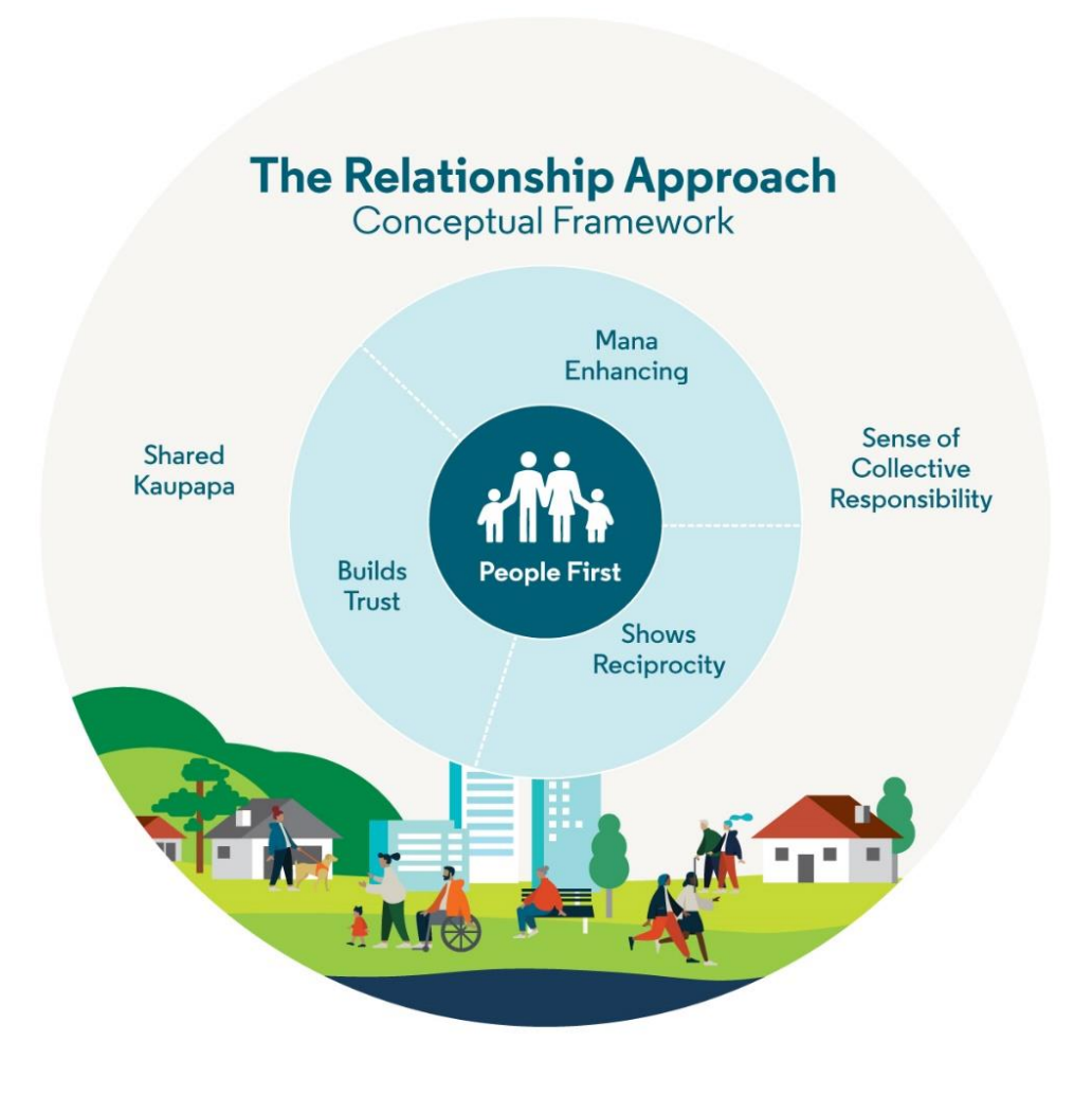
Figure 2 – Respondent Relationship Approach conceptual framework