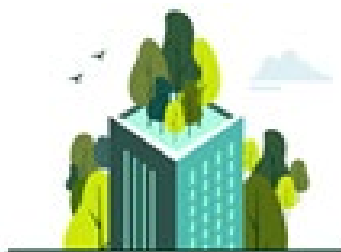
Trees in Cities Challenge