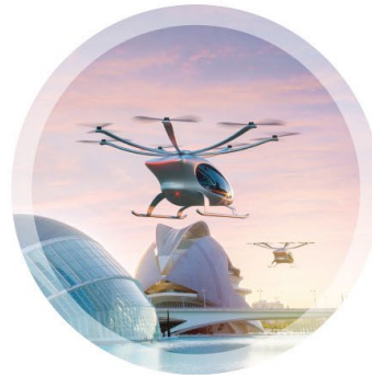
SUSTAINABLE MATERIALS FOR FUTURE MOBILITY