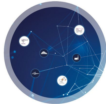
SUSTAINABLE DISCOVERY AND SUPPLY