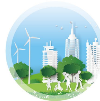
RAW MATERIALS AND CIRCULAR SOCIETIES