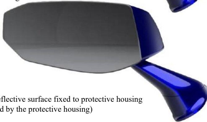
Figure 3: Reflective surface fixed to protective housing (not enclosed by the protective housing)