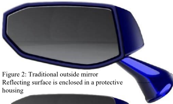
Figure 2: Traditional outside mirror Reflecting surface is enclosed in a protective housing