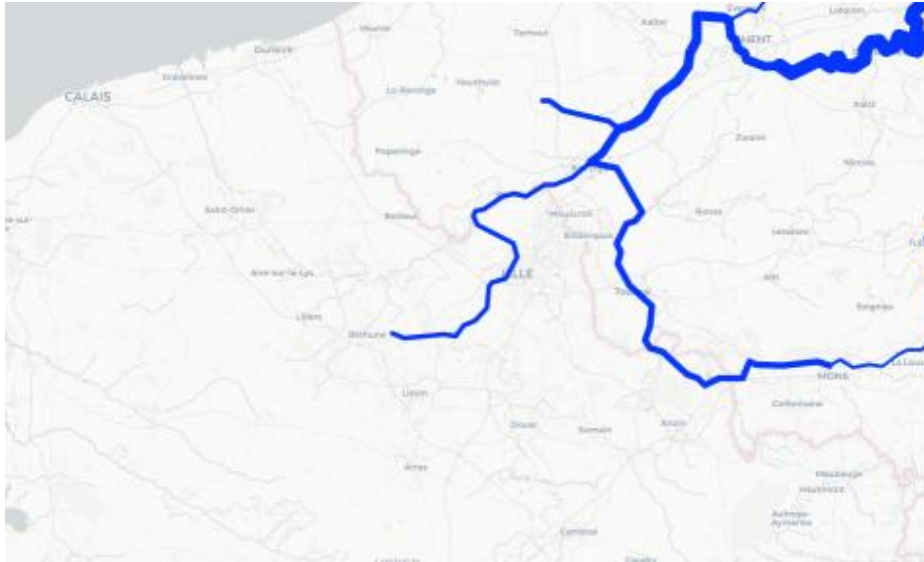
Figure 2 France Nord-Pas de Calais IWW volumes from modelled map, 2020

the produced map only showing volumes between Cuinchy, Lille and the Belgian border at Deûlemont (Figure 2), while the map from VNF shows significant quantities also to the sea at Dunkerque (Figure 3). This is likely due to the data quality issues listed above (although the quantities shipped in Lille appear to be similar to the national statistics, with quantities from the national source of around 5204kt at Lille compared to 5808 kt on the map.)