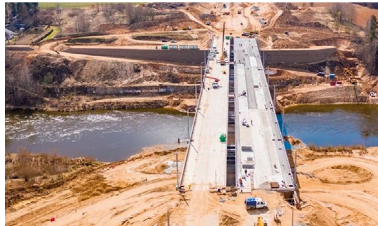
Figure 4: Construction work underway for a new bridge across the River Neman

Source: Presentation of Grodno at the UNECE 69 th session of the Commission, 20-21 April 2021.