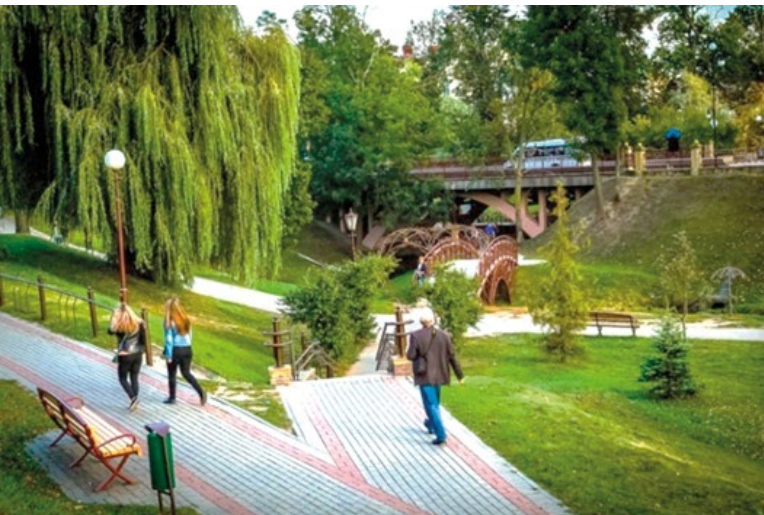
| Figure 2: Green areas in Grodno

Grodno has a well-developed public transport network. The route network for urban passenger transport is more than 1,300 km in length and has 91 routes - 55 bus routes, 19 trolley bus routes, and 17 express routes (for shuttlebuses). The city has recently completed the construction of a new six-lane highway with an interchange, and construction work is underway for a fourth automobile bridge across the River Neman. This bridge will connect residential and industrial areas in the city and help create the city's belt road. At 44.5 km 2 , green areas are a key feature of the cityscape of Grodno and take up over 30 per cent of the city's footprint. The largest green urban area stretches across 4 parks – Kolozhsky, forest park Physhki, Rumlevo and Lososno. Furthermore, each year the city plants 7,000 new trees and bushes. Other infrastructure projects include the construction of a football stadium, a health clinic in the Vishneveys neighbourhood, a kindergarten, an outpatient clinic, and a school in the Olshanka neighbourhood.