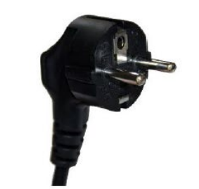
Type C: This will fit