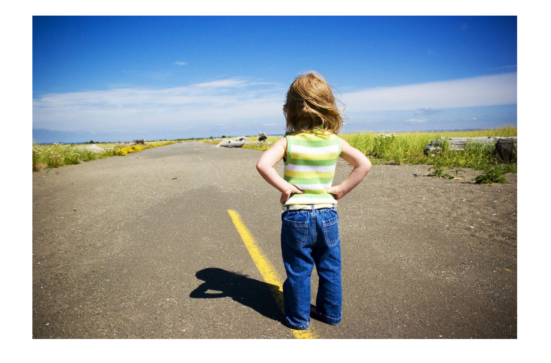
The Road to Standards Based Modernisation