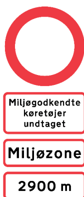
Notification of prohibition with additional panel