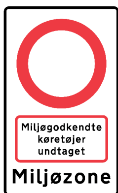
Sign having zonal validity

According to the convention on road signs and other road markings it is possible to use;