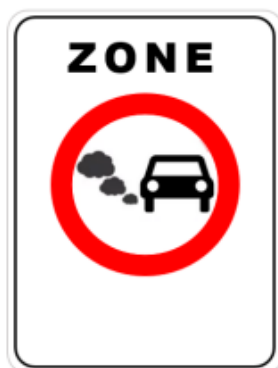
Sign having zonal validity

Proposal for a new sign in the convention only for low emission zones and zero emissions zones.