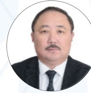
Mr. Nurkan Sadvakassov

First Deputy Minister of Internally Displaced Persons from the Occupied Territories, Labour, Health and Social Affairs, Georgia