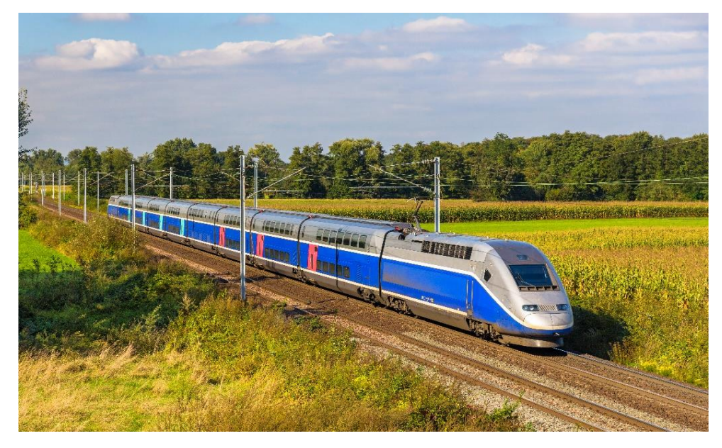
Exhibit 1: Examples of Combinations of Items of Railway Rolling Stock

9. "Separate rail bogies connected to compatible road vehicles" are to be considered as an item of Railway Rolling Stock.