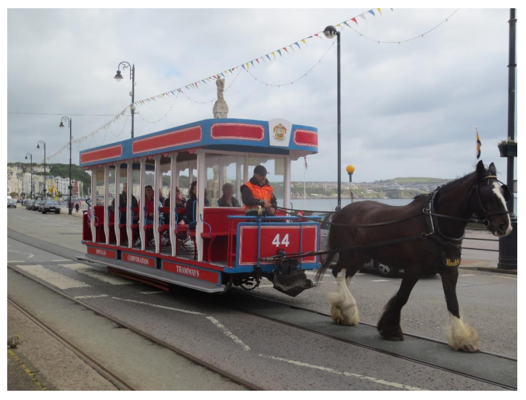
(Note: refers to the tram elements)