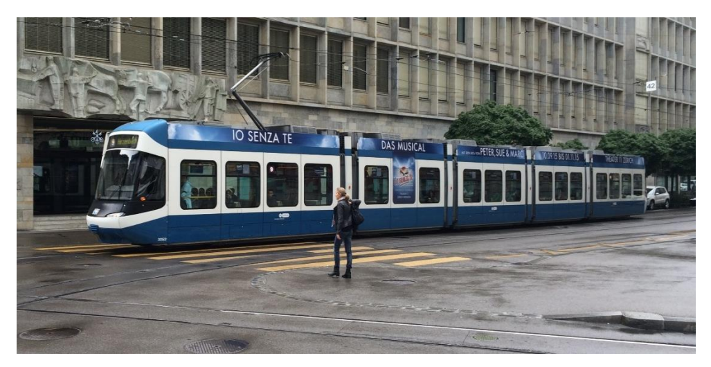
Exhibit 2: Examples of One Item of Rolling Stock