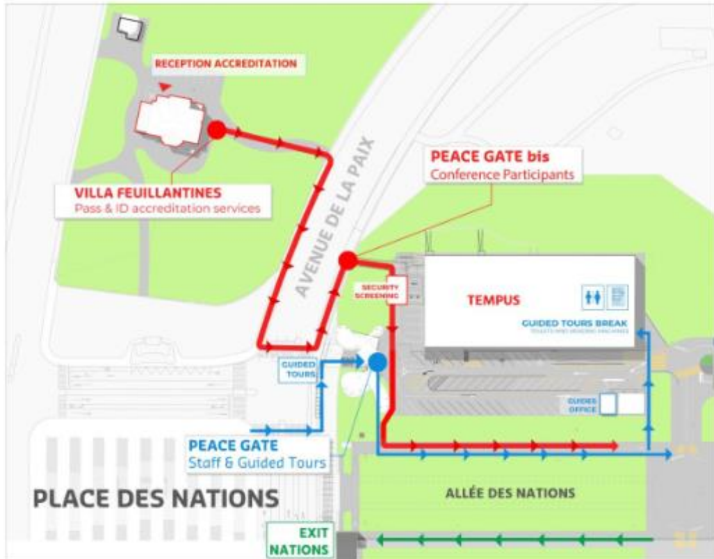
UPGRADE OF PREGNY BUILDING Temporary relocation of Pass & ID Accreditation Services from September 2022 to April 2023