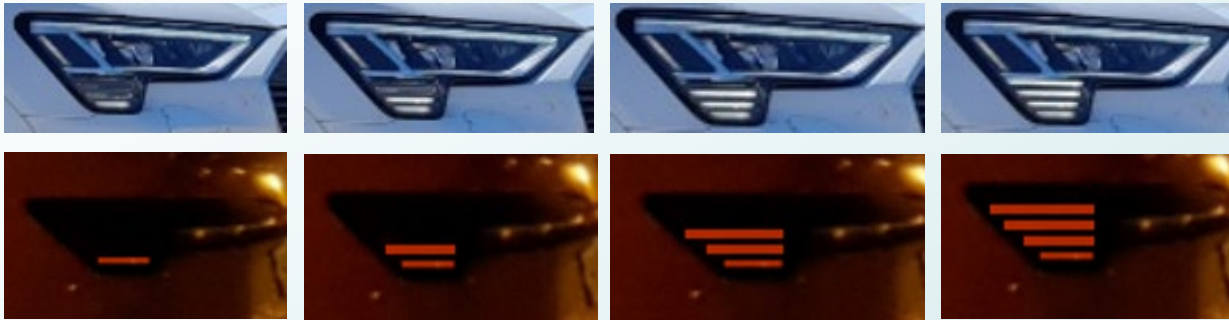
Modified with light bars for illustration only.