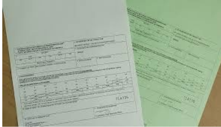
black on white