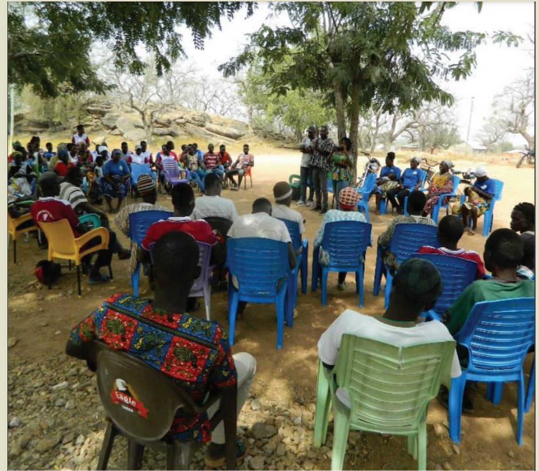
community consultations