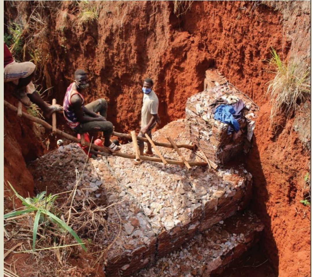
Gully rehabilitation in the Republic of Rwanda, as part of a five-country regional AF-funded project.