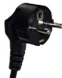
Type F: This will NOT fit