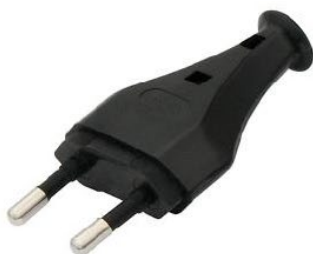
Type C: This will fit