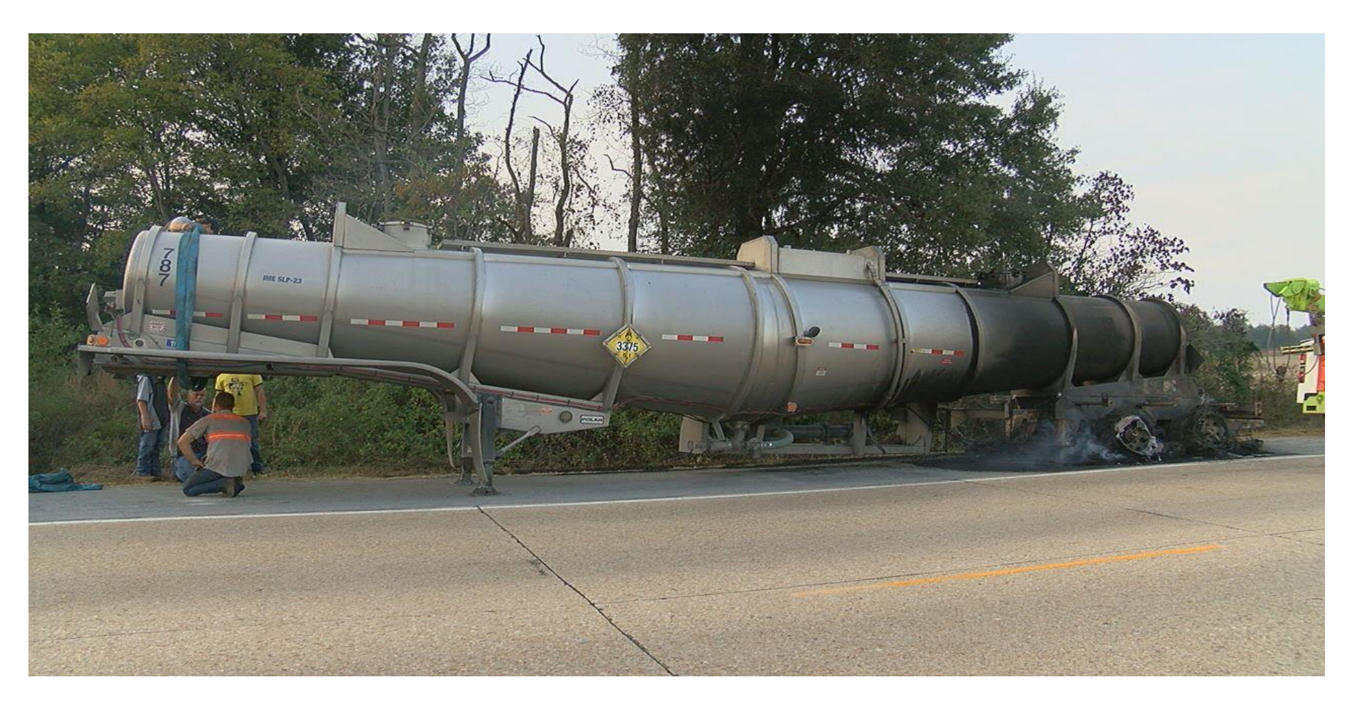
Figure 1. The tanker after the fire had died down