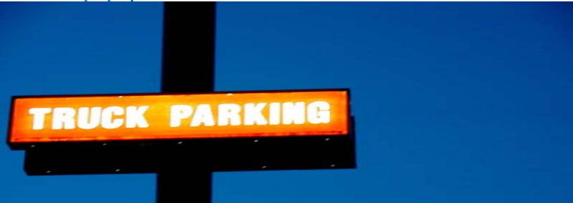
Information & Reservation systems for Truck Parking