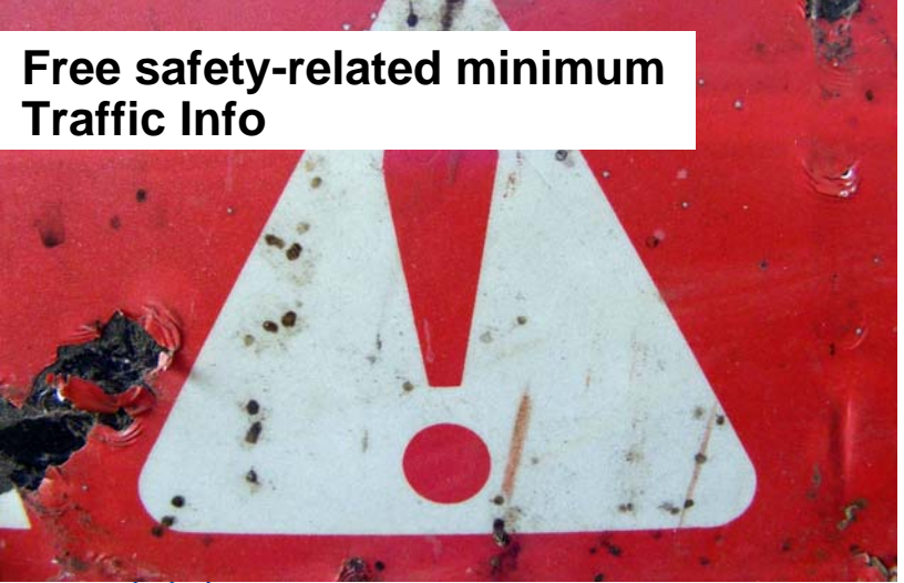
Free safety-related minimum Traffic Info