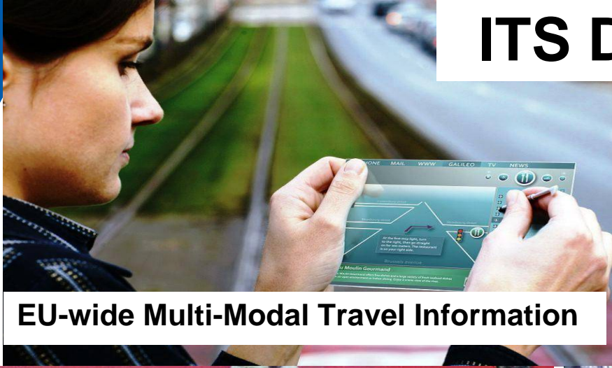
EU-wide Multi-Modal Travel Information