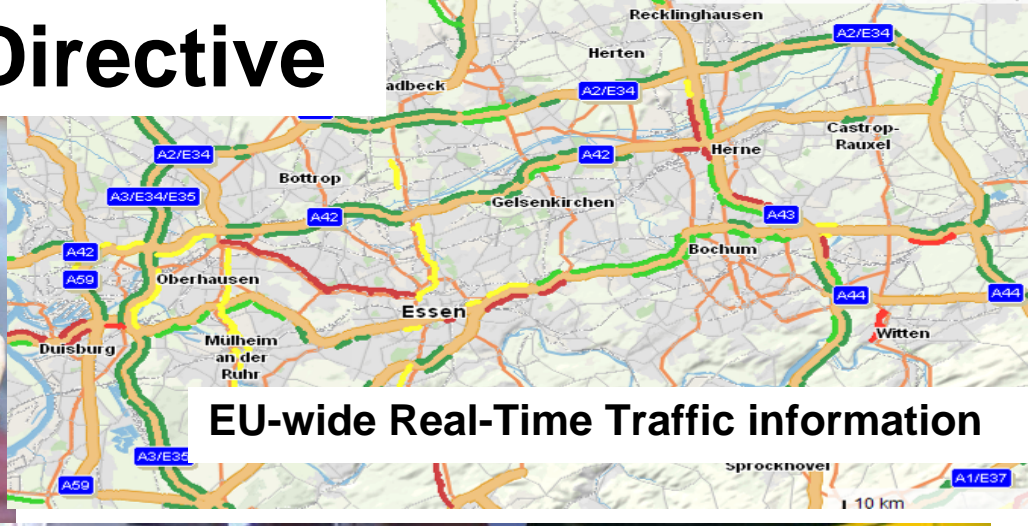
EU-wide Real-Time Traffic information