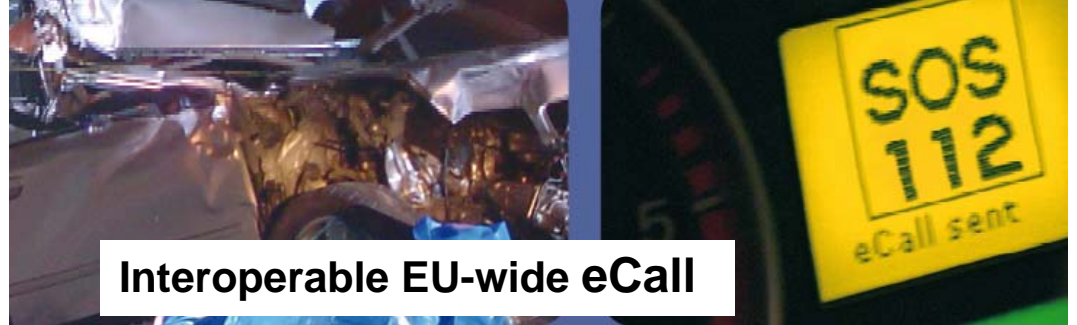
Interoperable EU-wide eCall