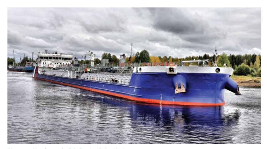
River-sea oil tanker on the Svir (Russian Federation).

RIS technical services are based on technical and operational standards, which were initially defined and continuously updated by the International RIS Expert Groups. To ensure interoperability throughout the entire transport and logistics chain, the