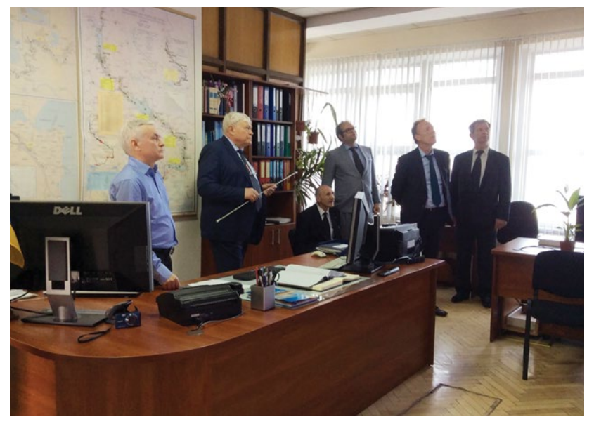
Visit of the delegation of the Harlingen Maritime Academy to the Head Ukrainian RIS control centre, 19 April 2017.