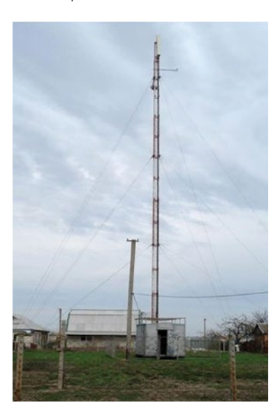
Automated Ukrainian RIS post on the Dnieper (Ukraine).

Resolution No. 57 was adopted by SC.3 on 21 October 2004 at its forty-eighth session. Intended to establish a single pan-European approach to the planning, implementation and use of information services in inland navigation, the resolution aimed to ensure a high-level of safety, efficiency and fluidity of inland water traffic and the protection of the environment throughout the E waterway network.