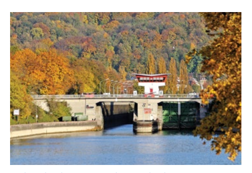
Lock on the Rhine near Basel (Switzerland).

National stand-alone telematic services for inland waterways in Europe have been developed since the late 1980s, however, the project that paved the way for the development of the RIS concept is the "Inland Navigation Demonstrator for River Information Services" (INDRIS)<sup>5</sup> of the European Union (1998–2000); it provided a set of open standards for information