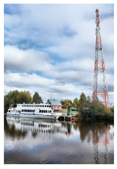
Passenger vessel and telecommunications tower on the river Kovzha (Volga-Baltic waterway, Russian Federation).