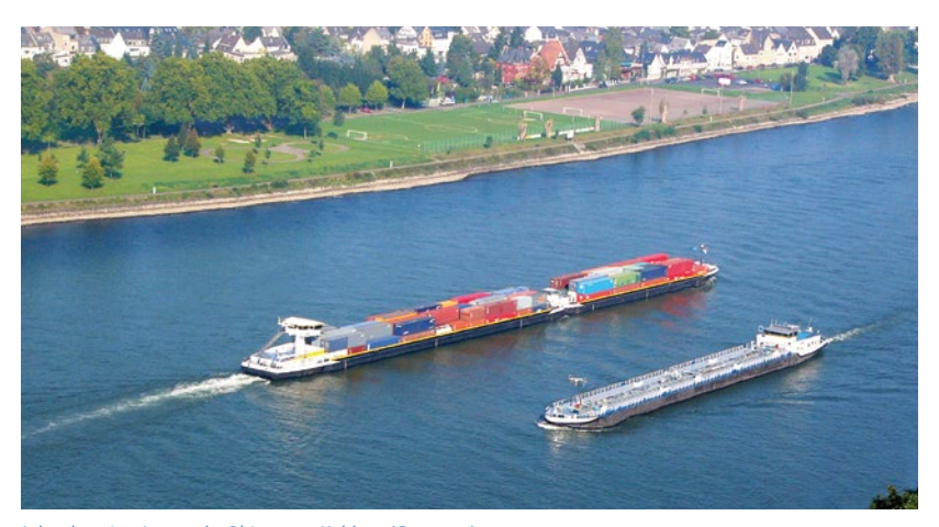
Inland navigation on the Rhine near Koblenz (Germany).

Since 2001, SC.3 has developed and maintained a set of resolutions on RIS that is harmonized with the various resolutions, regulations and guidelines of the European Union, Central Commission for the Navigation of the Rhine (CCNR), the World Association for Waterborne Transport Infrastructure (PIANC), the International Association of Marine Aids to Navigation and Lighthouse Authorities (IALA) and other international organizations.