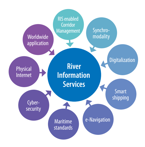
Figure III Trends in the development of RIS for the upcoming period

The background and perspectives for the evolution of RIS are laid down in: