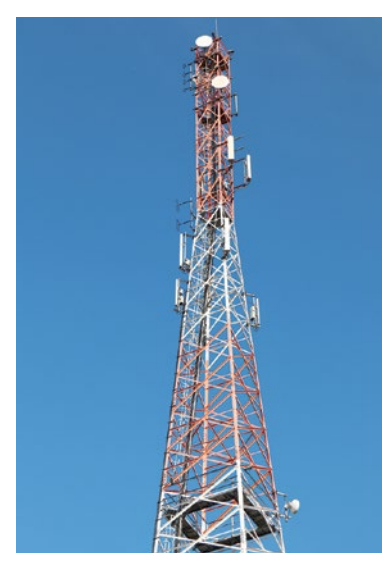
Telecommunications tower near the village of Annensky Most on the river Kovzha (Volga-Baltic waterway, Russian Federation).

Information to support Calamity Abatement (CAS) is the operational service that facilitates the actions