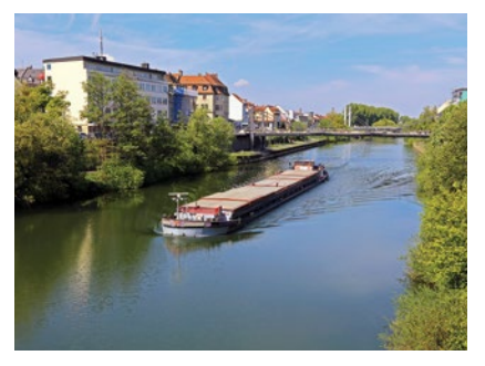
The Main-Danube canal in Bamberg (Germany).

To ensure that RIS is harmonized and standardized throughout the inland waterway network, the PIANC RIS Guidelines in 2019 introduced the concept of RIS Enabled Corridor Management, aimed at linking operational services together on a route or a corridor in order to provide a harmonized set of services to support skippers on their voyage on the network.