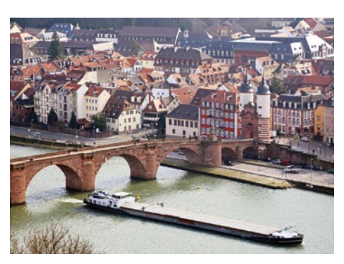
The Neckar in Heidelberg (Germany).

The role of RIS for inland navigation as one of the priorities for the forthcoming period was emphasized in the Wroclaw Ministerial Declaration "Inland Navigation in a Global Setting" of 18 April 2018, signed by eighteen Member States of the United Nations and supported by resolution No. 265 "Facilitating the Development of Inland Water Transport", adopted by the