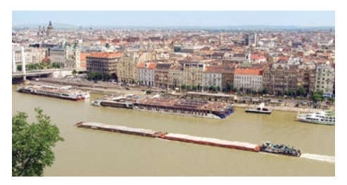
Convoy on the Danube in Budapest.

The revised standard is available at https://unece.org/transport/standards/transport/international-standards-notices-skippers-resolution-no-80-0. The appendices are available in electronic format in English only using the same link.