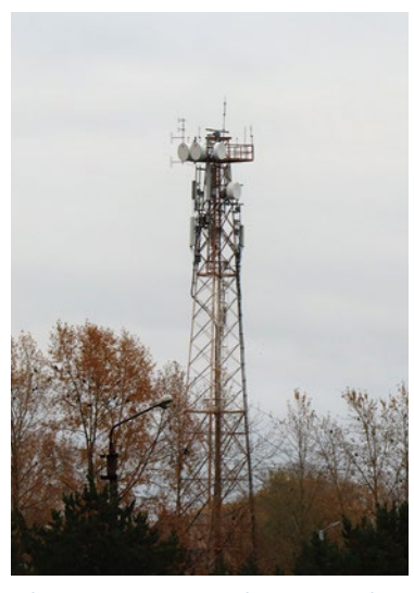
Telecommunications, RIS and VTS tower on the river Sheksna (the Russian Federation).

Guidance is provided for establishing VTS on inland waterways, in particular, where IMO Resolution A.857(20) is not applied, and aims at enhancing navigation safety in cross-border areas where two regulatory regimes exist, i.e. in estuaries, lakes and other areas where inland waterways connect with the sea and vessels cross the boundaries of responsibility of maritime and river administrations.