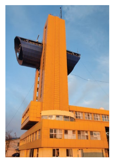
The Head Ukrainian RIS control centre, Port of Odessa (Ukraine).