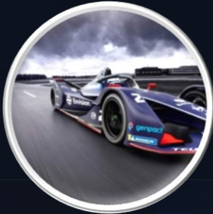
High Performance E-Mobility