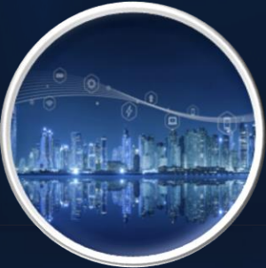
AI + IoT Software