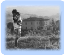
Time and place