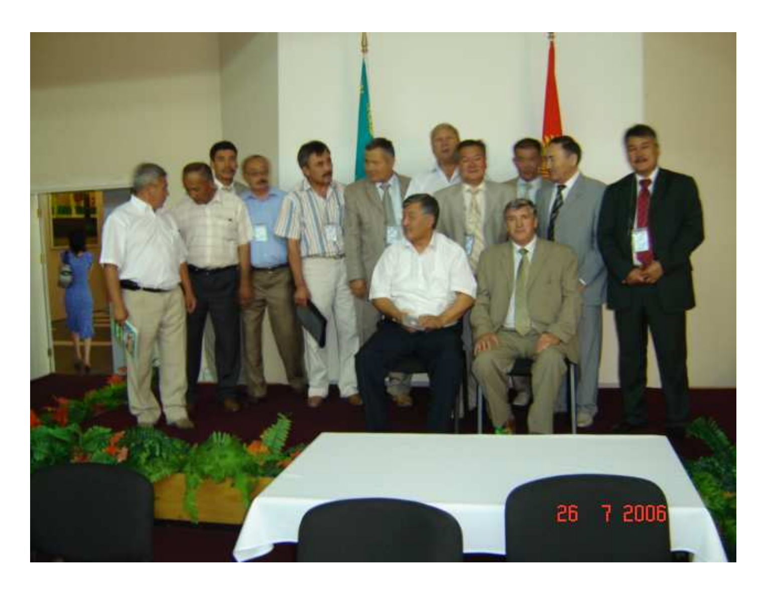
Inauguration of the Chu-Talas bilateral commission 26 July 2006