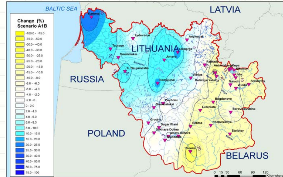
Example of the multi-model map with summer runoff forecast until 2050

*(coordinated) basin-level actions are needed