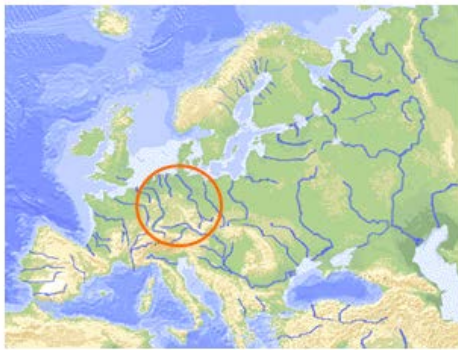
Germany – in the middle of Europe

Germany shares 8 river basins with its neighbors and is Party to six international river basin commissions, including Rhine, Danube, Elbe and Oder.