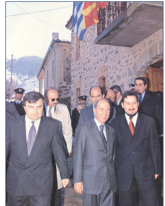
PP Declaration, 2000