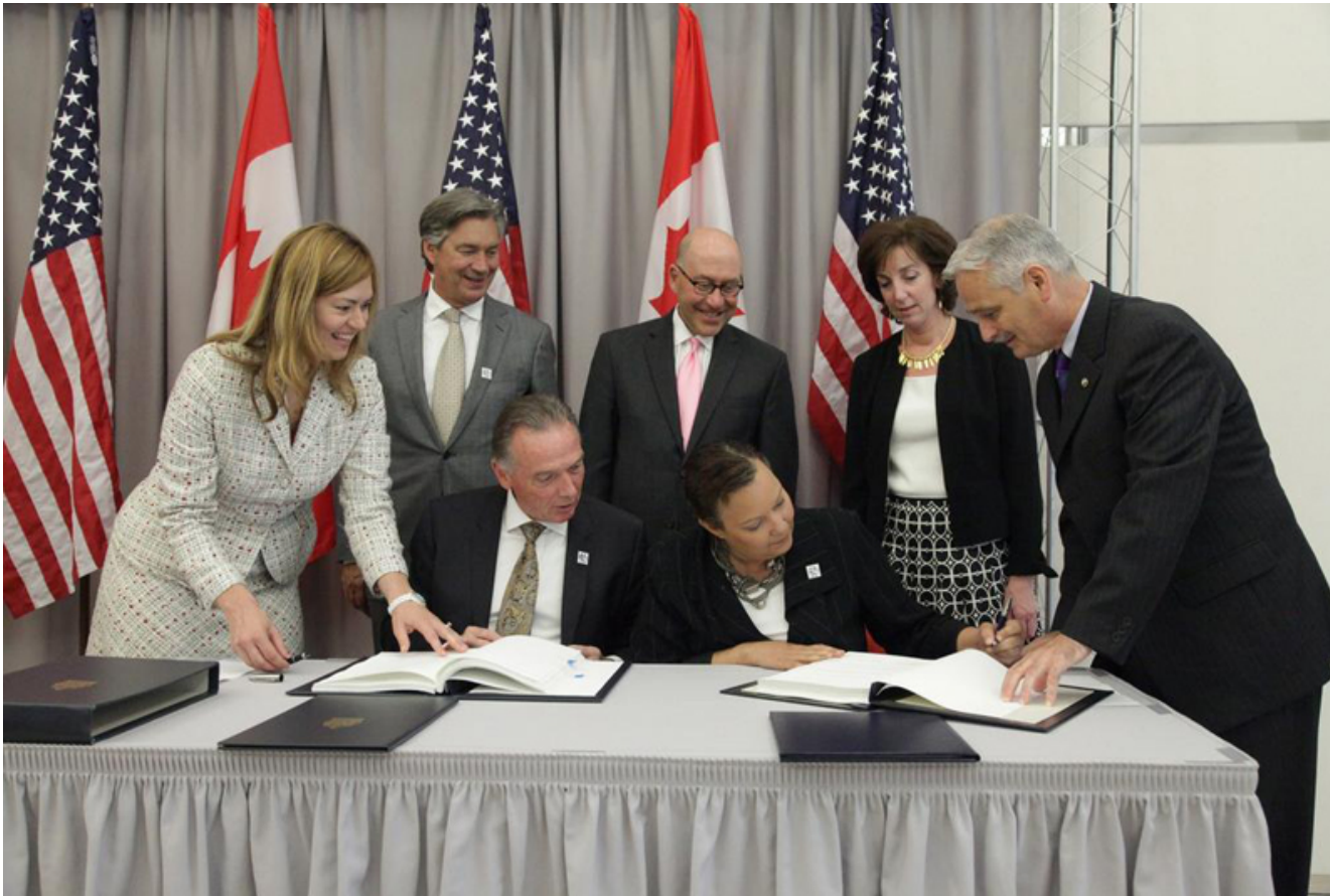
US EPA Head Lisa Jackson and Canadian Environment Minister Peter Kent sign the updated Great Lakes Water Quality Agreement in 2012