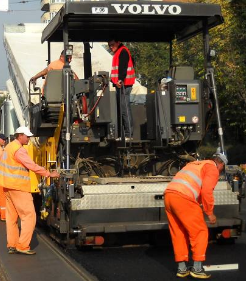
Cold recycling of a rigid pavement in Iasi using foamed bitumen