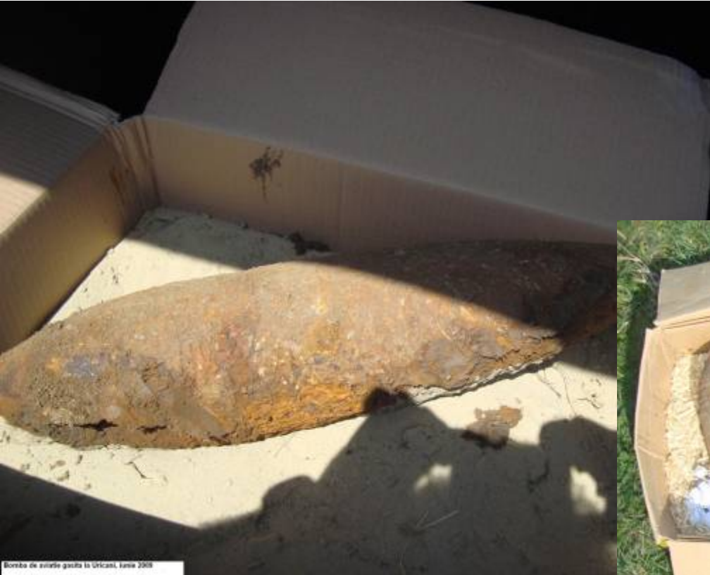
Bomba de aviação caída la Urucani, Lima 2008