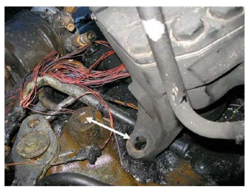
Figur 2:Viser at styresnekken har løsnet fra sine opprinnelige festepunkter i rammen.

The van was a Volkswagen Transporter 2008 model. It was compact and well loaded but no overload.