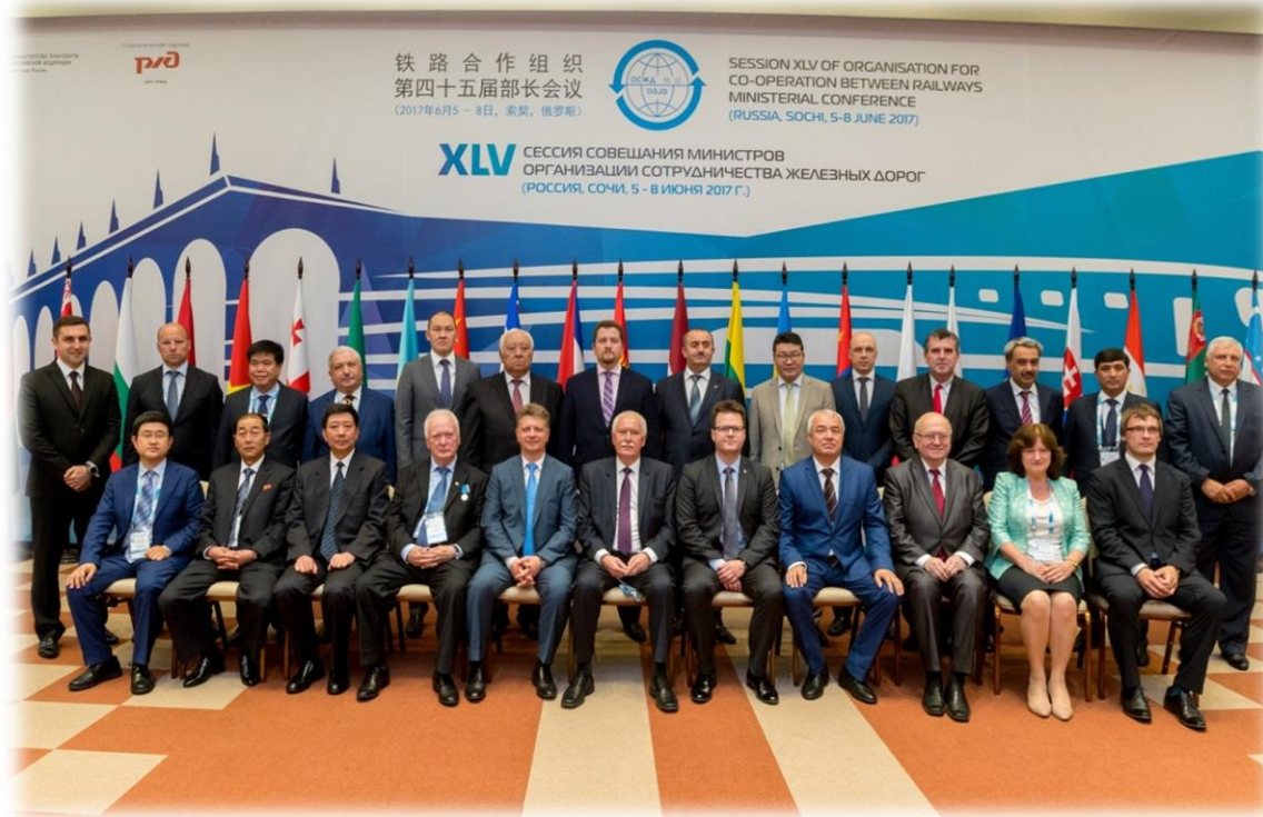
The XLV OSJD Ministerial Conference session (Russia, Sochi, 5-8 June 2017)