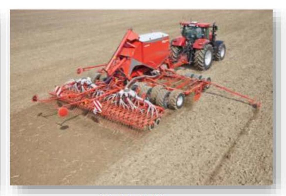
Work in field