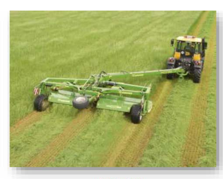
Work in field