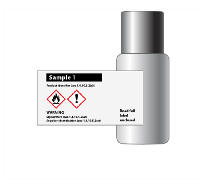
Example of individual container label