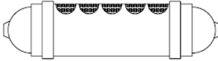
Figure H.1 - Cylinder orientation and layout of exposure areas