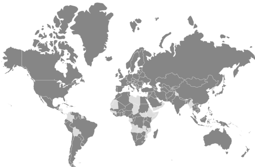
Figure 2 UNECE and non-UNECE member States Contracting Parties to at least one United Nations transport convention

Legend: Dark grey: Contracting Parties - Light grey: non-Contracting Parties