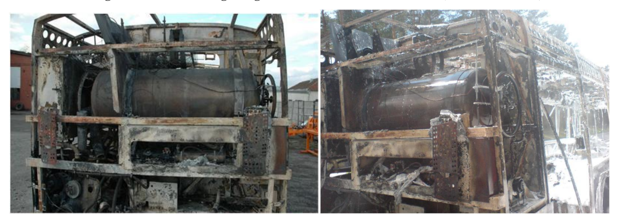
Figure 1: Results of engulfing fire on Polish LNG-fuelled bus

• Shall the emergency response forces be informed about the additional danger, that there is an LNG fuel tank on board the vehicle carrying dangerous goods?