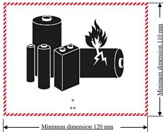
Lithium battery mark