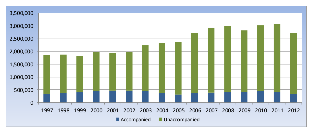
Graph 2 Intermodal road/rail transport in Europe (UIRR companies) Accompanied (RoLa) and unaccompanied traffic (1997–2012)