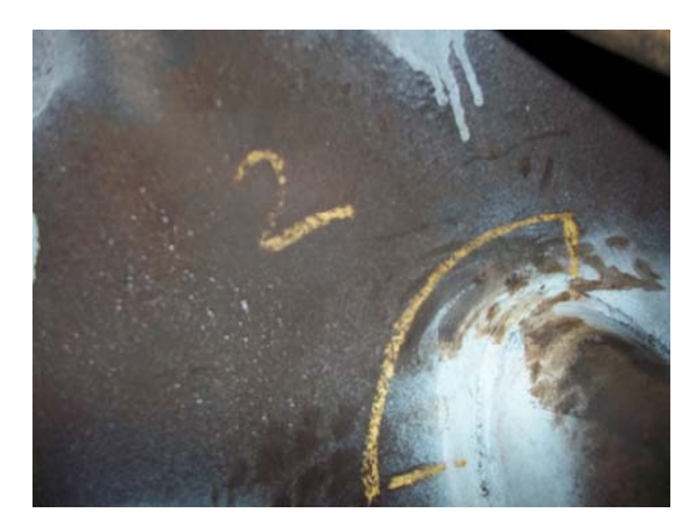
Nozzle 2 is the tanker filling connection (is connected to internal fill pipework) and has a 90 mm long crack as indicated below:

Nozzle 1 houses the temperature gauge blind pocket and has a 25 mm long crack as indicated below: