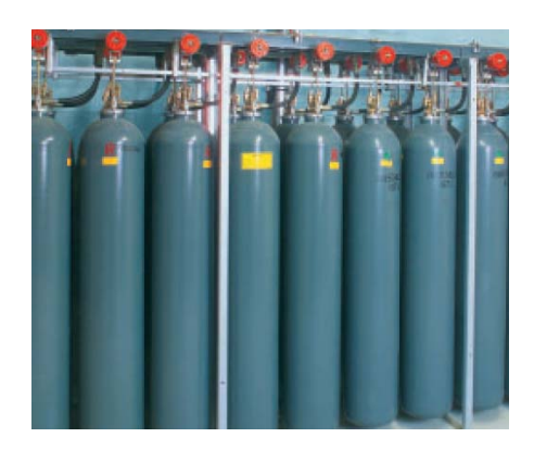
Pictures 4 and 5: Gas cylinders used in stationary fire extinguishing systems