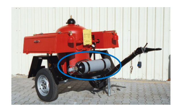
Pictures 1 to 3: Gas cylinders and gas cartridges used in fire extinguishers